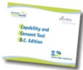
Capability and Consent Tool - BC Edition